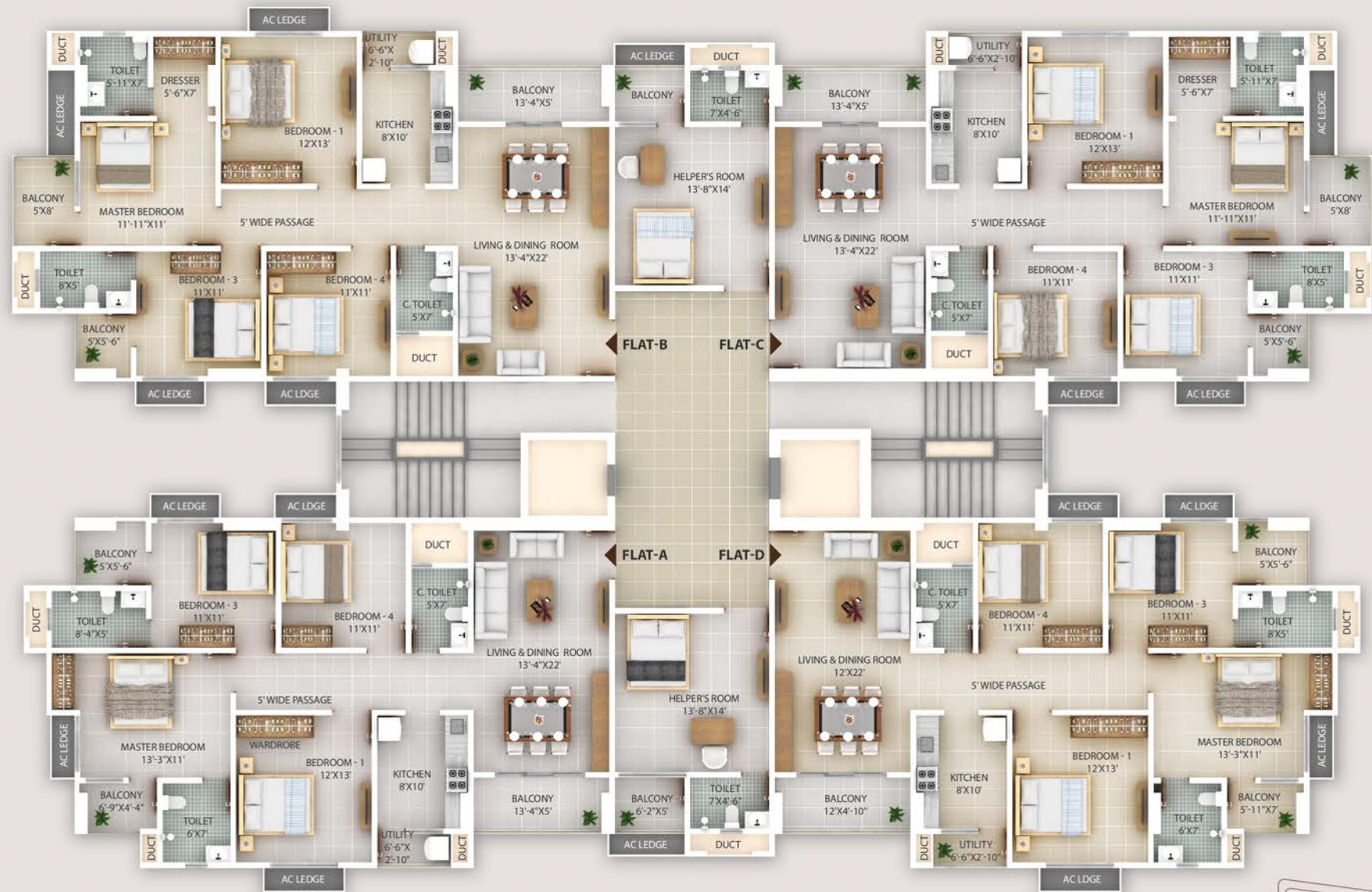
4 BHK FLOOR PLAN FROM 2ND - 9TH FLOOR FOR BLOCK D